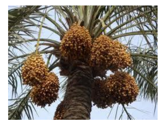
Fig. 1. Fruit dates plant in Turbat.