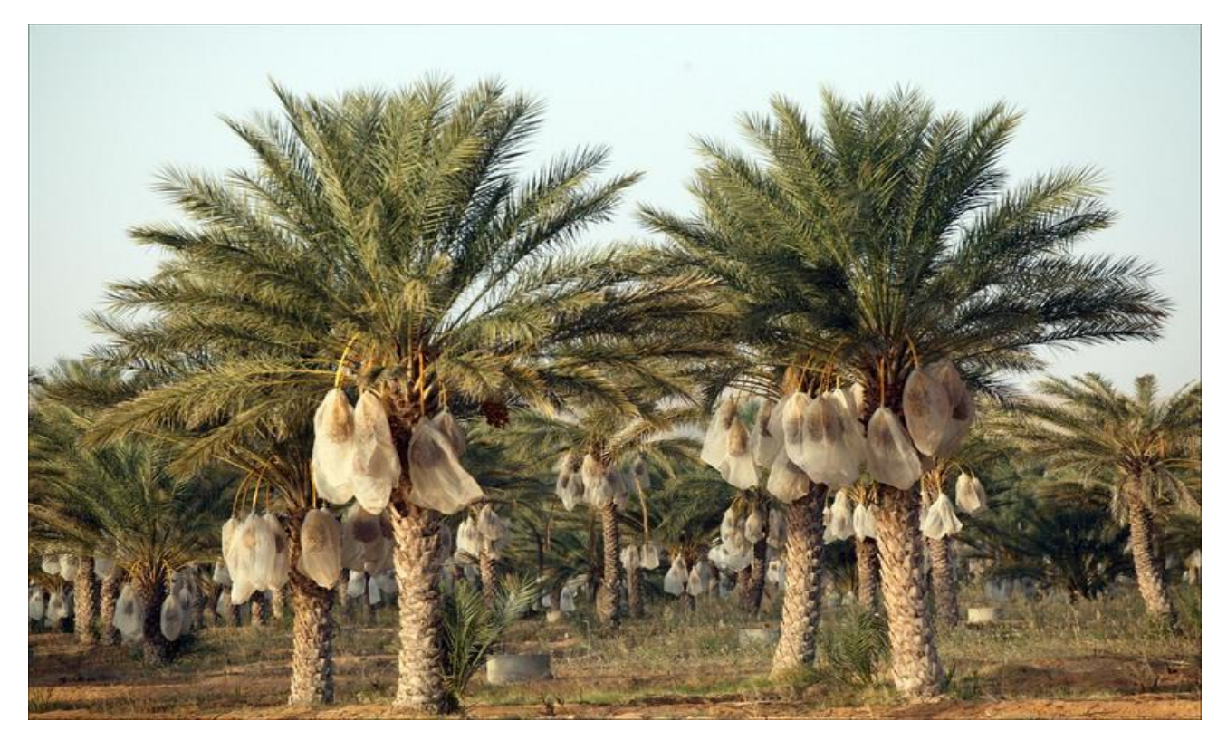
Fig. 2. Fruits dates plants farm in Punjgur, Balochistan.

The objective of this investigation was to regulate the quantities of trace elements in the sprinkle hastened on the surface of plams. Additionally, this trial was targeted at estimating the fruit as a biomonitoring of trace elements pollution in Turbat and Punjgur in Balochistan in order to consider whether the fruitlets were harmless for human eating.