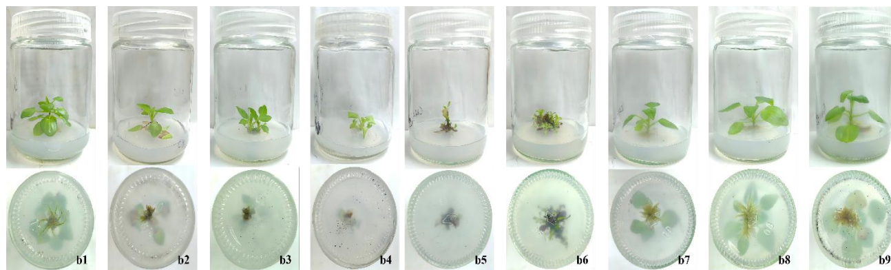
Fig. 2. Screening of seedling-strengthening culture media.

CK: Untreated control group; a1-a4: Germination status of seeds soaked in 0.50 or 1.00 mg/L GA 3 for varying durations; a4-a9: Under the precondition of 1.00 mg/L GA 3 soaking treatment, germination rates and seedling growth performance on media supplemented with varying concentrations of GA 3 (0.50, 1.00 mg/L), 6-BA (0.50, 1.00 mg/L), and IBA (0.20, 1.00 mg/L) PGRs.