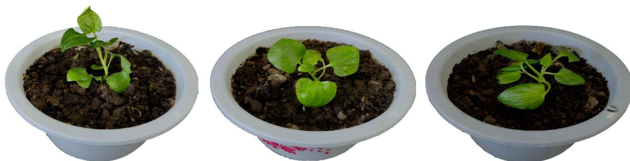
Fig. 4. Results of acclimatization in natural soil.

c1: 0.50 mg/L NAA + 2.00 mg/L GA 3 + 0.20 mg/L IBA; c2: 0.50 mg/L NAA + 2.00 mg/L GA 3 + 0.50 mg/L IBA; c3: 0.50 mg/L NAA + 0.20 mg/L GA 3 + 1.00 mg/L IBA; c4: 1.00 mg/L NAA + 0.20 mg/L GA 3 + 1.00 mg/L IBA.