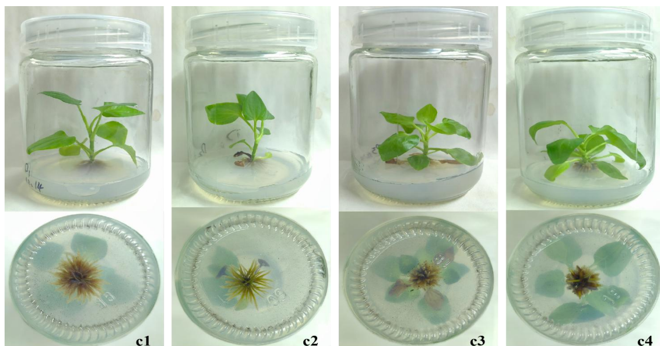
Fig. 3. Effects of different hormone combinations in subculture media on seedling growth.

Future research will focus on optimizing the tissue culture conditions for S. chinensis , shortening the seedling development period, enhancing seedling robustness, and elucidating the symbiotic mechanisms between S. chinensis and its endophytic microbiota.