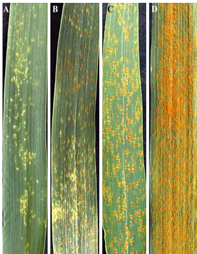
Fig. 2. Modified Cobb Scale; severity of wheat LR categorized as: A, resistant; B, moderately resistant; C, moderately susceptible; D, susceptible.

Several other APR genes were assigned Lr numbers namely Lr68 ; Lr74 ; Lr75 ; Lr77 and Lr78 . Tong et al. , (2024) identified Lr68 upon the longer arm of 7B. It might be originated from Frontana (a Brazilian cultivar) which also has the APR genes Lr13 and Lr34 as its ancestor. Lr68 locus is flanked by two marker loci Xgwm146 (0.6 cM) as well as Psy1-1 (0.5 cM), but they are not appropriate for MAS. Who found out that a dominant marker called csGS (1.2 cM) and a co-dominant marker called cs7BLNLR (0.8 cM) were created for APR Lr68 .