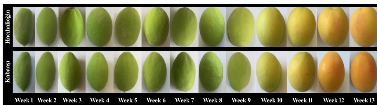
Fig. 1. The different development stages of the cultivars of Hacıhaliloğlu and Kabaası.

Phenolic compounds, especially gallic acid and catechin, were analyzed according to the method of Hussain et al. (2013) with slight modifications. Separation was performed on an Agilent 1260 series HPLC system with a diode array detector (DAD) and a Poroshell 120 EC-C18 column (2.7 µm, 4.6 mm × 150 mm). A gradient mobile phase comprising 83% phosphoric acid and 17% acetonitrile at a flow rate of 1 mL/min and an injection volume of 20 µL was used. The elution profile of the gradient was as follows: 83% A for 1 min, 70% A for 2 minutes, 60% A for 4 min, and 83% A for 10 min. The operating conditions included detection wavelengths of 210 nm and 300 nm, an injection volume of 20 µL, and a column temperature of 20°C.