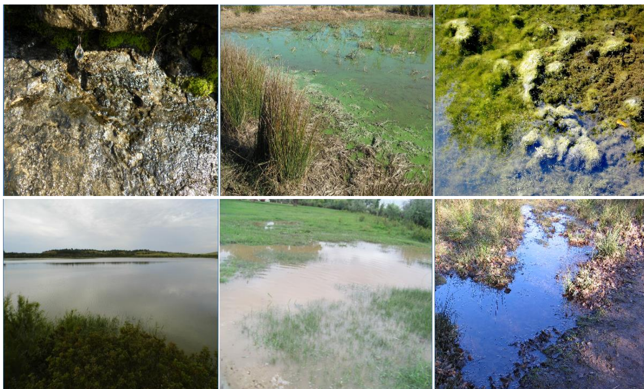
Fig. 1. Sample collecting sites where growth of algal flora is proliferating.

Species sampling is done through hand picking, squeezing and scarping. Then samples have saved in plastic bottles of 1liter. Identification was done onsite with the help of compound microscope based on morphological characteristics.