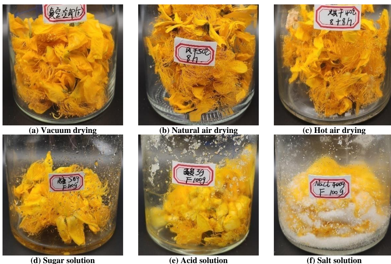
Fig. 1. Different pretreatment methods of H. monogynum .

Effect of the different treatments on the mineral element content of H. monogynum : Figure 3 lists the mineral elements found in H. monogynum , a common source of K and Ca minerals. According to this study, H. monogynum is high in essential elements like K, Ca, Mg, S, N, and P. The levels of K, Ga, and Mg are particularly high among them, which benefits its general quality, biological resistance, and growth circumstances (Alzate et al. , 2007). There is a low content of S, N, and P elements, although they are the building blocks of many proteins and biological enzymes in plants.