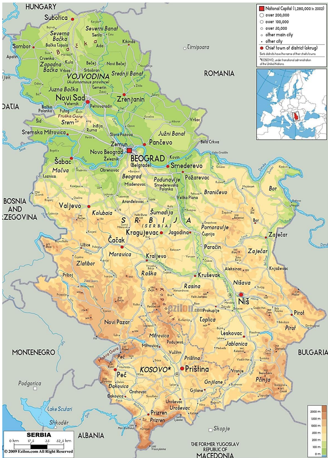
Fig. 1. Map of Serbia with the geographical position of Serbia in Europe ( http://www.maps-of-europe.net/maps/maps-of-serbia/detailed-physical-map-of-serbia-with-all-roads-cities-and-airports.jpg ).