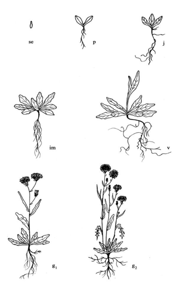
Fig. 2. Ontogenesis Crepis tectorum L. (Ontogenetic atlas ..., 2013, p. 139).

Nowadays, in all countries there are large collections of systematic herbarium including millions of herbarium leaves, which are basis for studying floristic biodiversity. The largest and oldest herbaria are herbaria in British Museum, Paris, Geneva, in the USA (National Herbarium and in New-York botanical garden), in Russia - Herbarium of Komarov's Botanical Garden with more than 5 mil., specimens of plants, Moscow State University named after M.V. Lomonosov, Moscow Teacher Training University, Tver University, Tomsk University and some others. At the same time intraspecies biodiversity is rather poorly studied and it is not represented in these herbaria. The formation of Ontogenesis herbarium and official registration of its collection in the International catalogue «World Herbaria» of New York botanical garden are to solve this problem. This herbarium has an international index MARI (site _ http://sweetgum.nybg.org/ih/herbarium.php?irn=176924). The credit is greatly due to Honoured Scientist, Dr of Biology, Prof. L.A. Zhukova.