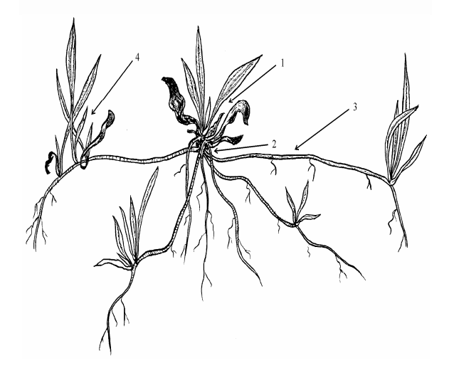
Fig. 3. Polycentric system of rootshoots P. lanceolata:

2. Thematic (by polyvariant) herbarium includes materials on polyvariant of individual development of plants (Zhukova, 1995; Zhukova & Osmanova, 1999; Osmanova, 2007, 2008). The following types of polyvariant are represented rather full: morphological polyvariant of vegetative and generative organs ( Betula pendula Roth., Fragaria vesca L., Plantago lanceolata L.), extreme display of morphological polyvariant was the change of living form; polyvariant of types of reproduction, for example in unstable habitats P. lanceolata has additional type of reproduction – vegetative, with the main type – seed reproduction. Figure 3 shows polycentric system of rootshoots P. lanceolata .