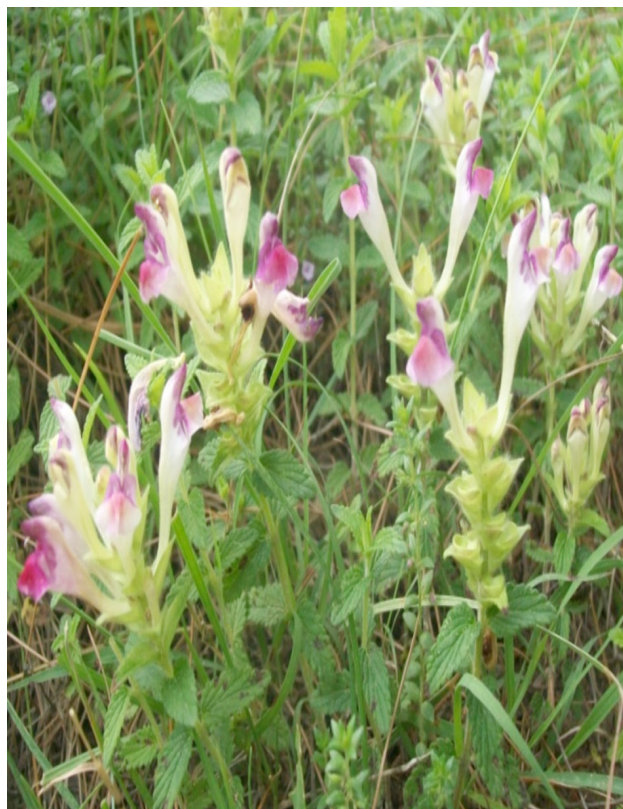
Fig. 1. Scutellaria chamaedrifolia habit and habitat

Field data collection: As information available through herbaria did not have geographic coordinates in our case, it was impossible to locate the actual habitat of species keeping accuracy. For this reason, data obtained through personal field surveys was mainly relied. Subpopulations were identified after through survey over a period of three years. Locations were georeferenced using GPS (Garmin Etrex Vista H). Species absence points at regular intervals were also taken. GPS data were regularly saved in computer system using Mapsource™. Locations were reconfirmed through Google Earth™, removing ambiguous points from the data. 13 presence points along with 1913 absence points were used in the final analysis.