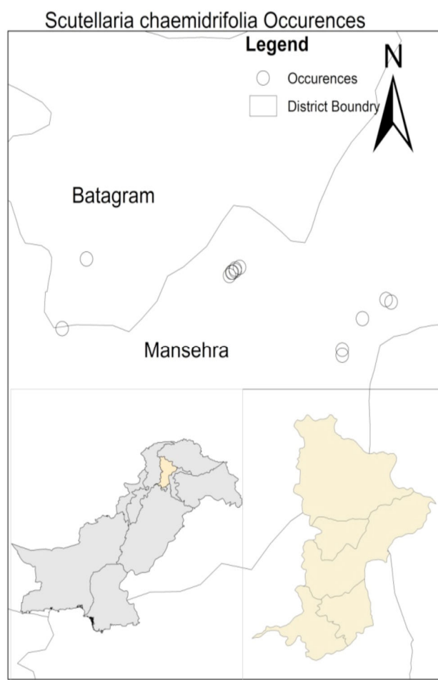
Fig. 3. Species occurrence records obtained through field surveys.

Model success and predicted areas: GRASP has shown significant success regarding the predicted localities. Model performed best as ROC remained (0.99) describing model stability, r^2 = 0.568 (more than half) and r = 0.403 showing insignificant correlation among predictors. Lehmann et al. (2002) while applying the model on Cyathea found the predictions satisfactory lying in the similar range. Highest probability level was shown in mid ranges targeting the areas where species had been collected in past. Model also predicted new localities from the Amazai area of Haripur district adjoining the Buner District, Dubair area of Kohistan District along the borders of Swat and Shangla district (Fig. 3). Some of the recent reports from the adjoining areas of Swat support current predictions (Ilyas et al. , 2013). The whole area from west to east make a continuous range with high probability value (0.9) reflecting the evolution and spread of S. chamaedrifolia from this region. The other important area outside of this range is Galiat area of Abbottabad district with p=0.8 at maximum. Despite through field visits no population could be found in this area, however a population has been reported from adjoining areas of Kunhar valley.