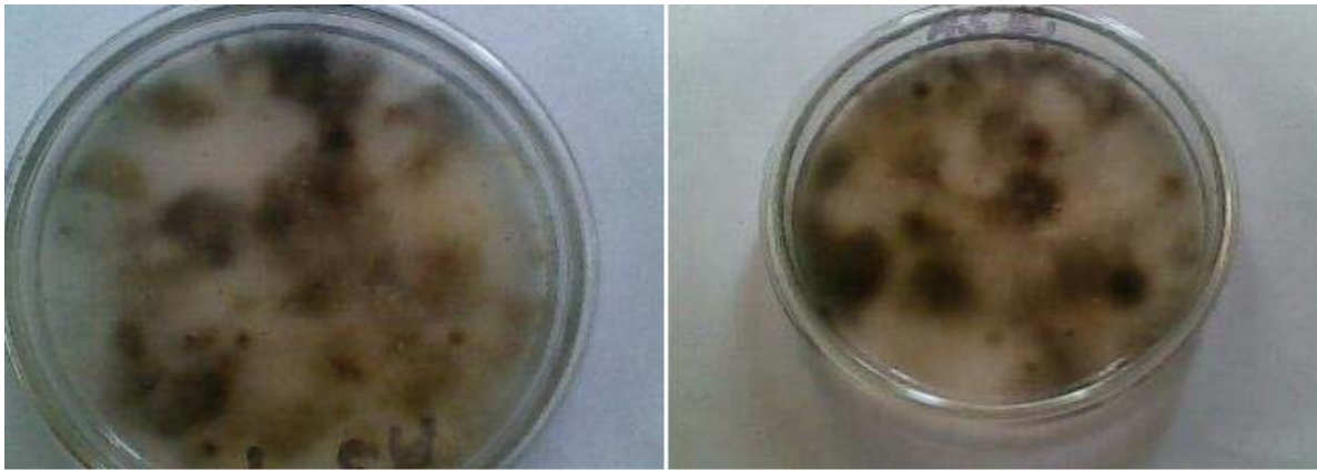
Fig. 2. Fungal spores growing in the Petri dishes.

becoming reservoir for inoculums of various fungi disseminating infection to nearby trees or neighbouring orchards (Zafar et al. , 2007). Fuel to the fire on this attack of quick decline/ collar rot, which once established, kills the plants within days. Hence, detailed and comprehensive measures should be carried to find root cause of DBD and how it spreads and invades the vascular tissue of mango trees. This study will be useful to formulate an integrated strategy to combat decline complex of mango trees and subsequently increasing fruit yield and boosting revenue of the country.