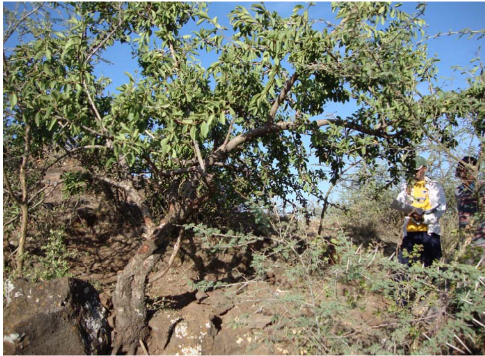
Fig. 2. Ximenia americana L., identified at Xadacha study site in acacia vegetation; picture corresponding author November 23, 2009.