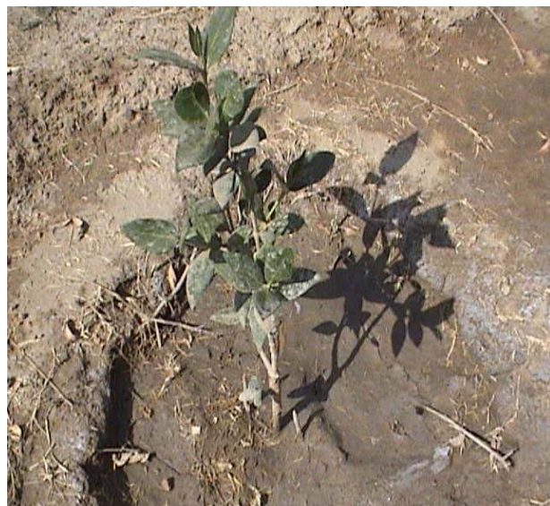
Fig. 1. Seedling after nine months.

SAND= Sandspit, FUU= Federal Urdu University, Ns= Non-significant, S= Significant