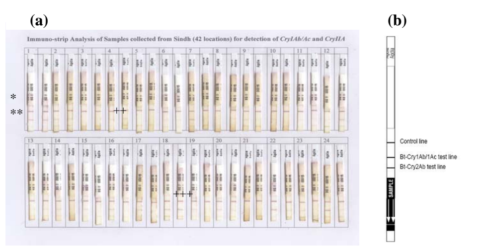
Fig. 2. (a) ImmunoStrip analysis: *control line, **test line for CryIAc , +++ high concentration, ++ medium concentration, + low concentration. (b)-General image of Strip STX006800.

Almost 50% cotton growing area has been observed to be occupied by Bt cotton in the Punjab province in 2007-08. Maximum area under Bt cotton was located in Khanewal, Vehari and Bahawalnagar districts (60-65%). Of all the genotypes planted in field, Bt-121 (Neelum 121) occupied major area (more than 40%), and was relatively better than other Bt genotypes as regard to uniformity. A wider range of segregation (20-30%) among other Bt cotton varieties was observed in some of the fields.