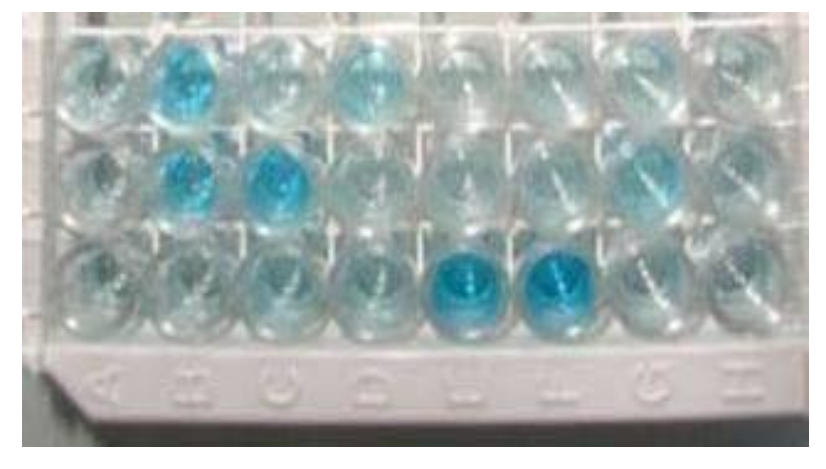
Fig. 3. ELISA for the detection of npt-II protein. Wells with blue color show positive reaction.

Laboratory analysis for the detection of Cry protein in Punjab: The ImmunoStrip analysis revealed that samples collected from 90% (76/84) locations were positive for Cry protein (Fig. 2a, Table 2). Samples expressing positive reaction harbor CryIAc gene whereas no reaction was detected for Cry2Ab and Cry1F genes (figure not shown for CryIF). As regard to the intensity of protein expression at 76 positive locations, samples from 27 locations (36%) showed high (+++) concentration of toxin whereas 35 locations (46%) exhibited medium (++) and remaining 14 locations (18%) showed very low (+) concentration (just visible) of toxin. In fact, many factors are responsible for this variable expression such as gene position effect, reduced gene silencing resulting from homology with some endogens (co- suppression), number of integrated copies, genetic background of parent species, different 3' end regions (Matzke & Matzke, 1994; Sachs et al., 1998) influence of plant's development and environment etc., (Down et al., 2001). At a time, one or a combination of these factors may be operating to drive the transgene expression. The low level of Cry gene expression may not be a good sign because it is not desirable for durable resistance and may result in the development of cross resistance in target insect pest.