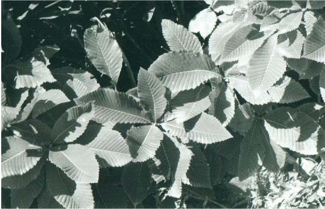
Fig. 1. General feature of Q. pontica .

The allocation of nutrients especially nitrogen within a tree have profound impacts on the physiology, growth and distribution of tree species. Tissue nitrogen concentration and allocation greatly influence the ecophysiology of species. Foliar nitrogen concentration is correlated with photosynthetic rates (Reich et al. , 1995; Martin et al. , 1998). Foliar nutrient content is widely recognized as an effective measure of the nutritional status of plants because leaves are the primary sites of physiological activity including photosynthesis, respiration, transpiration, gas exchange and nutrient storage (Orgeas et al. , 2002).