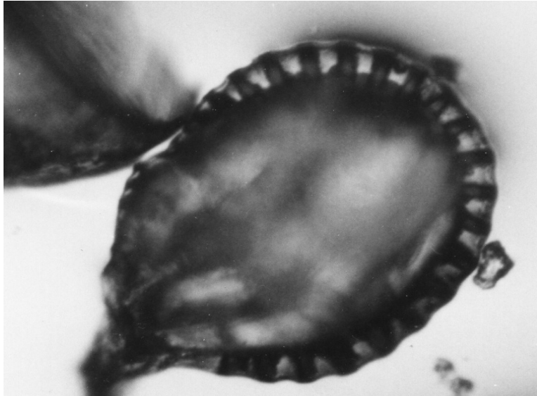
Fig. 3. Lateral view of the sporangium of Schizaea dichotoma , short stalk and annulus are prominent.