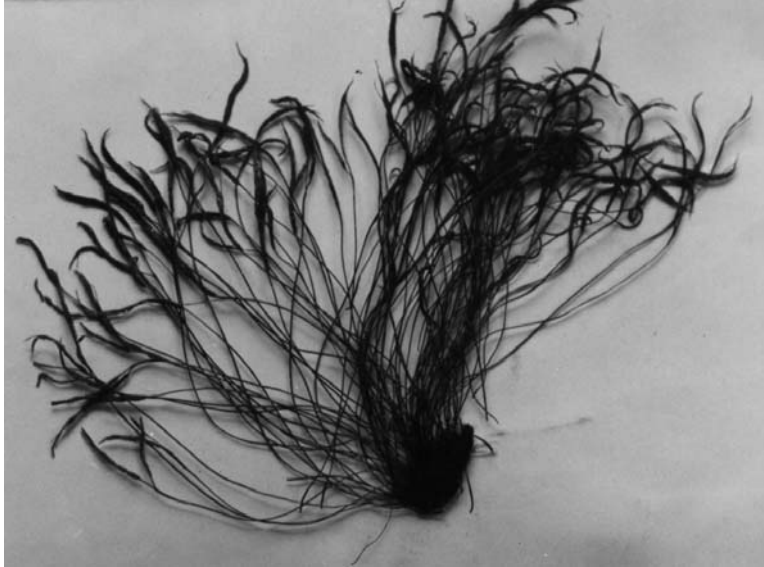
Fig. 1. Schizaea dichotoma with rhizome and fertile fronds.