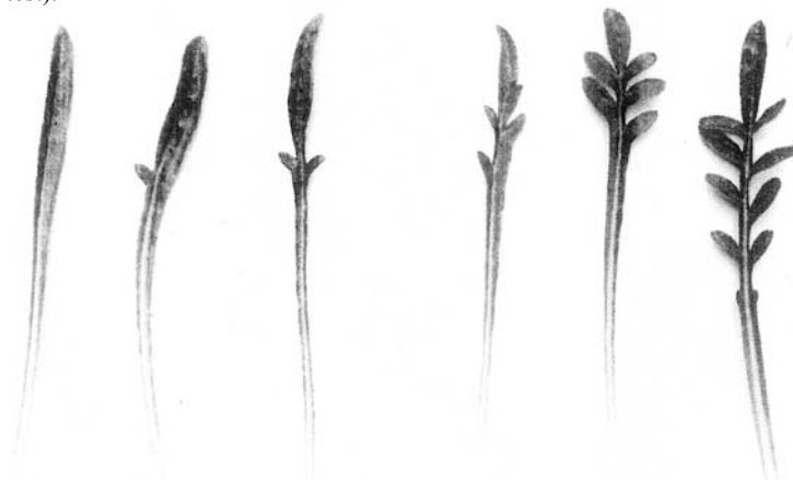
Fig. 3. Diagrammatic representation of variation in leaf shapes in Gazania splendens .