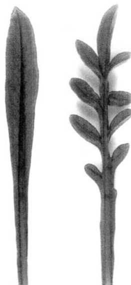
Fig. 1. Juvenile and adult leaf shapes of Gazania splendens .

Determination of anthocyanin content: Relative anthocyanin levels of Gazania splendens leaves were determined by incubating them overnight in 150 \mu L of methanol acidified with 1% HCl (v/v). After the addition of 100 \mu L of distilled water, anthocyanins were separated from chlorophylls with 250 \mu L of chloroform. Total anthocyanins were determined by measuring the A_{530} and A_{657} of the aqueous phase using a spectrophotometer. By subtracting the A_{657} from the A_{530} , the relative amount of anthocyanin was calculated as OD/g.fw. (Neff & Chory, 1998).