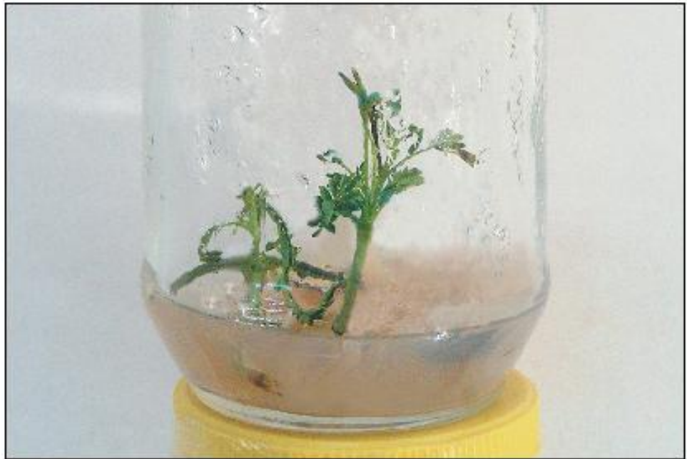
Fig. 2. Rooting of Acacia nilotica subsp. hemispherica on MS medium containing 30.0 mg/l IAA.