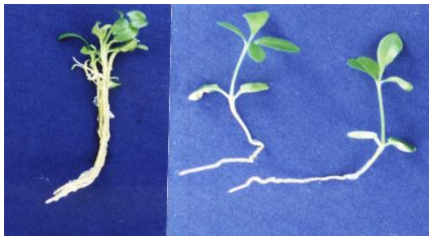
Fig. 2A. (A) Polyembryony (B) Monoembryony in Kinnow seeds.