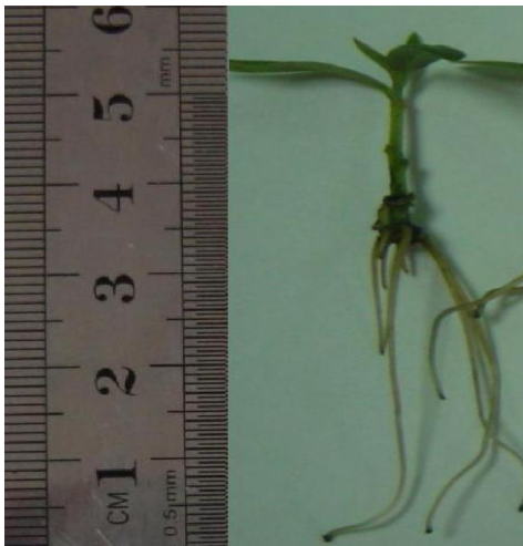
Fig. 2. Development of longest roots in tetranodal microcuttings at 1.25 \text{ mg l}^{-1} IBA ( T_6 ).