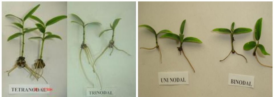
Fig. 1. Tetranodal microcuttings exhibiting more number of leaves as compared to tri nodal, binodal and uninodal microcuttings.

acclimatization. It is reported by Salisbury & Ross (1978) that roots help in absorption and movement of nutrients through the transportation stream with the help of water and maintain shoot-root balance, which is the most important factor for plant development ex vitro . The survived tetranodal microcuttings grew more quickly with lush green leaves and healthy stems up to a height of almost one foot (30 cm) within 6 months in glass house (Fig. 3). While uninodal, binodal and tri nodal microcuttings grew slowly and merely reached the stem length of 12 cm, 15 cm and 20 cm correspondingly in the same time interval (Fig. 4-a, b and c).