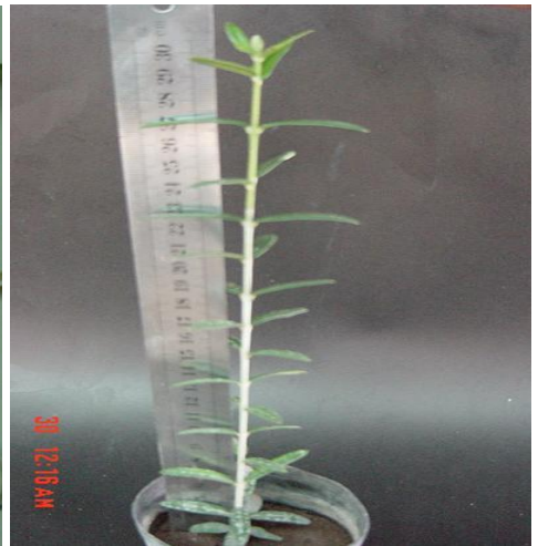
Fig. 3. Tetranodal micro cutting having 30 cm long stem with lush green leaves after six months in glass house.

There was a significant interaction between microcutting sizes and different concentration of IBA for survival percentage under the glass house conditions (Table 4). Tetranodal microcuttings showed the best interaction with 1.25 \text{ mg l}^{-1} IBA ( T_6 ) at which they had a maximum survival rate of 90.33% and proved significantly superior to all other microcuttings while trinodal microcuttings positively interacted with 1.50 \text{ mg l}^{-1} IBA ( T_7 ) to give 80.00% survived plants. Both uninodal and binodal microcuttings had