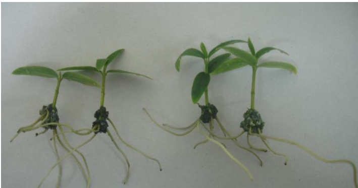
Fig. 5. Vigorous long roots produced at 1.25 mg l -1 IBA (T 6 ) consequently increasing the survival of microcuttings during acclimatization.