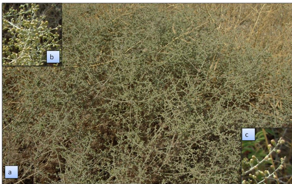
Fig. 2. A. sieberi subsp. sieberi a- General view of A. sieberi subsp. sieberi , b-c- General view of the plant's sinflorescence