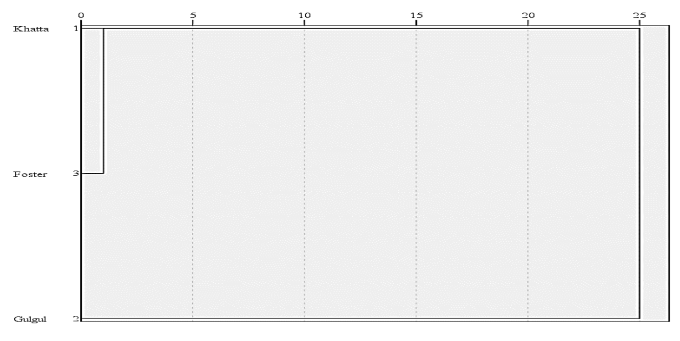
Fig. 2. Clustering analysis result of three samples.

E-Nerolidol (0-0.2%), selin-6-en-4α-ol (0-0.2%), αbisabolol (0-0.1%) and E, E-farnesol (0-0.1%) belonging to SAlcs are prominent. E-Nerolidol is relatively high in Galgal (0.2%), which was undetected in C. pennivesiculata (Lush.) Tan, was detected in Kharna khatta (tr-0.1%) produced in KP, Pakistan, previously (Haq & Wang, 2023). Selin-6-en-4 \alpha -ol is only detected in Foster (0.2%), which was only reported in the peels EOs of mandarin (0-0.5%)previously, to the best of our knowledge (González-Mas et al., 2019; Wang et al., 2013; Han et al., 2020). α-Bisabolol is only detected in Galgal (0.1%), which is undetected in pummelos, mandarins and grapefruits, usually not more than 0.2% in other species, is a characteristic component of citron, lemon and lime (Loizzo et al., 2016; González-Mas et al., 2019). E, E-farnesol is relatively high in Foster and Galgal (both 0.1%), which is undetected in mandarins,