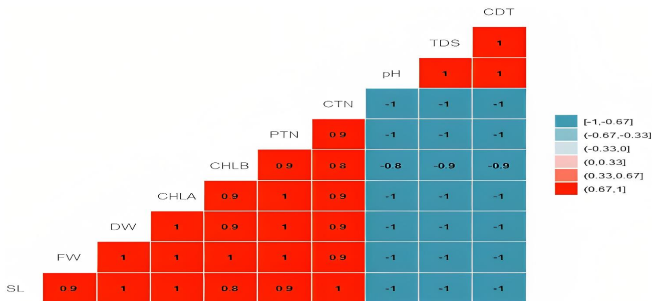
Fig. 2. Relationships of physical, biochemical and edaphic variables with their corresponding treatments and concentrations. Where, 1= Shoot length, 2= Fresh weight, 3= Dry weight, 4= Chlorophyll a, 5= Chlorophyll b, 6= Proteins, 7= Carotene, 8= pH, 9= Total dissolved salts (TDS), 10= Conductivity.