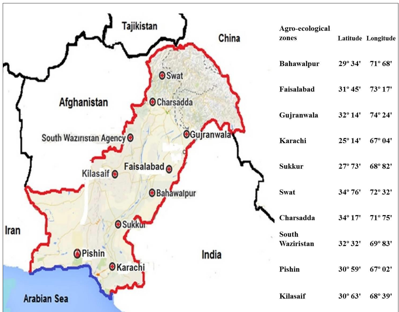
Fig. 1. Marked sampling sites from different agro-ecological zones of Pakistan and their coordinates.

Plant biochemical analysis: Total phenolic content (TPC) and total flavonoid content (TFC) were determined by method as described by Clarke et al. , (2013) and aluminum colorimetric method (Hussain et al. , 2013), respectively. Total antioxidant capacity and reduction potential of the samples were investigated according to the procedure described by Aliyu et al. , (2009). Antioxidant capacity of plants extracts was determined by using DPPH free radical scavenging assay (2,2-diphenyl-1-picrylhydrazyl) (Clarke et al. , 2013) with slight modifications. As DPPH inhibition percentage was high in all samples, so IC50 was also estimated.