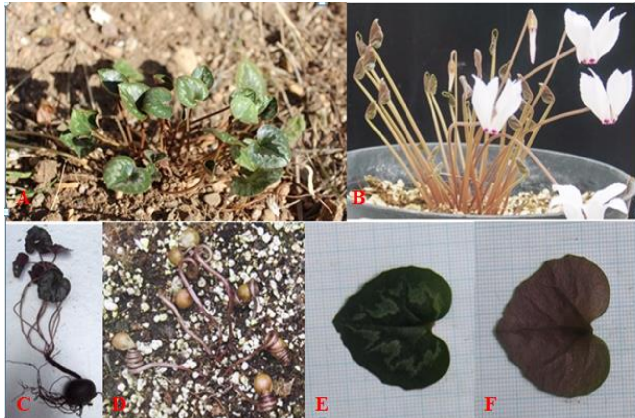
Fig. 3. C. mirabile : A), B) Plants in nature and in pots, C) Intact plant, D) Fruits of the species, E), F) Abaxial and adaxial sides of the leaves.