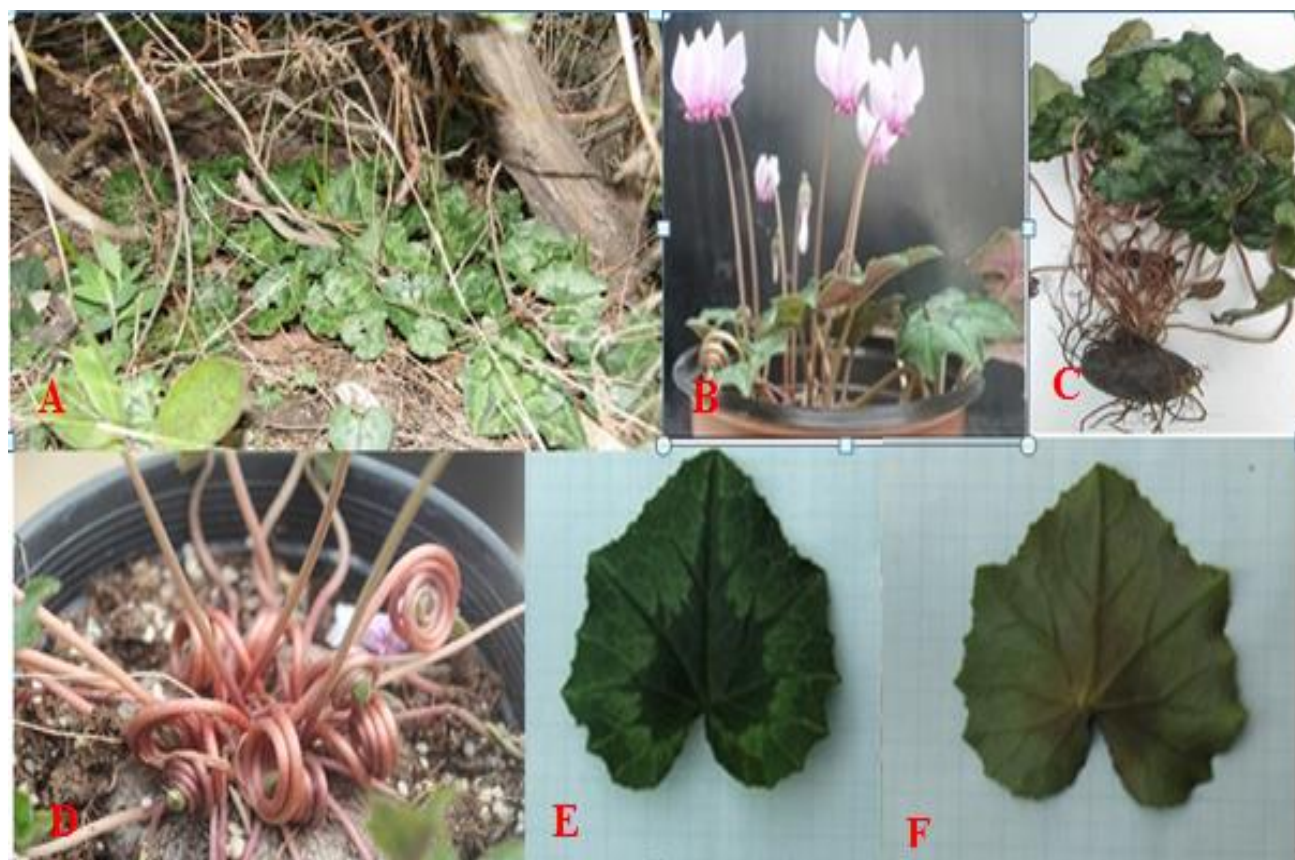
Fig. 2. C. hederifolium : A), B) Plants in nature and in pots, C) Intact plant, D) Fruits of the species, E), F) Abaxial and Adaxial sides of the leaves.