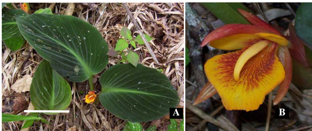
Fig 1. Cornukaempferia aurantiflora . A. Habit & B. Flower. (scale bars A = 10 cm and B = 1 cm).

Young leaves of C. aurantiflora (Fig. 1) were collected from natural habitats, then washed with running tap water, rinsed with 70% (v/v) ethyl alcohol for 30 seconds, sterilized with 0.9% sodium hypochlorite containing 2 drops of Tween 20 for 15 seconds, followed by three washes with sterilized distilled water. The young leaves were cut into 1x1 cm 2 pieces and cultured on MS medium (Murashige & Skoog, 1962) supplemented with 3% sucrose, 0.7% agar and 0, 0.1, 0.5, 1, 2 and 4 mg/l 2,4-dichlorophenoxyacetic acid (2,4-D) in the light for 16 weeks. Callus was transferred to regeneration medium i.e., MS medium, with 0, 0.1 and 0.2 mg/l 2,4-D and 0, 2 and 5 mg/l benzyladenine (BA) added for 8 weeks. The cultures were incubated at 25±2 °C under white, fluorescent light (2,000 lux) with a 16 h photoperiod. All the experiments were conducted using complete randomized design (CRD) with 20 replicates each containing one explant per culture tube. Data were analyzed using ANOVA and the mean separation was achieved by the Duncan's multiple range test (DMRT). The test of statistical significance was performed at 5% level using the SPSS program (version 11.5).