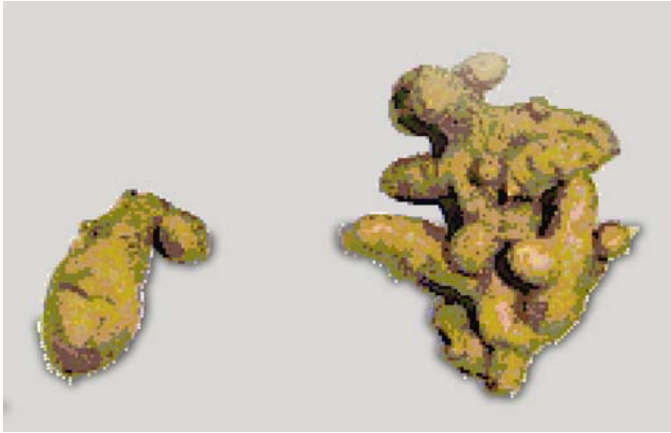
Fig. 1. De shaped potato tubers infected with Phytoplasma.