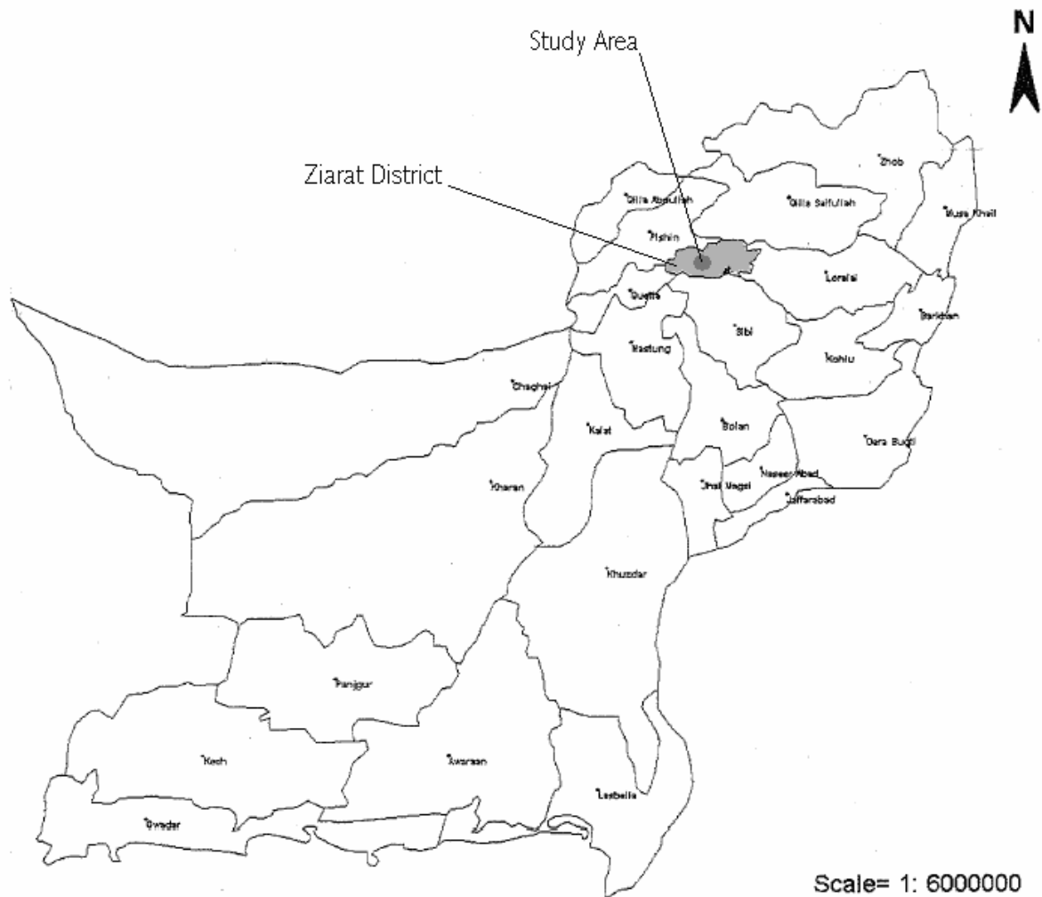
Fig.1. Map of the Study area.