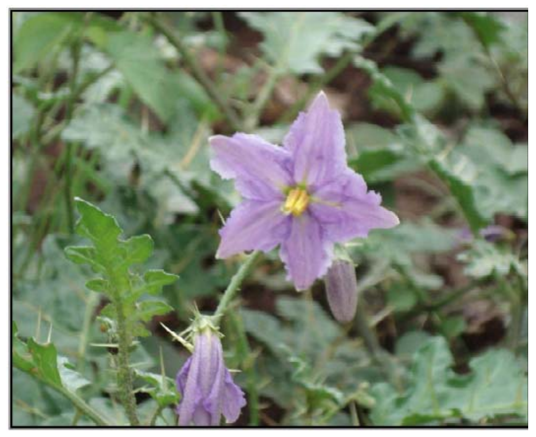
Fig. 1. Solanum surattense Burm with purple flowers.