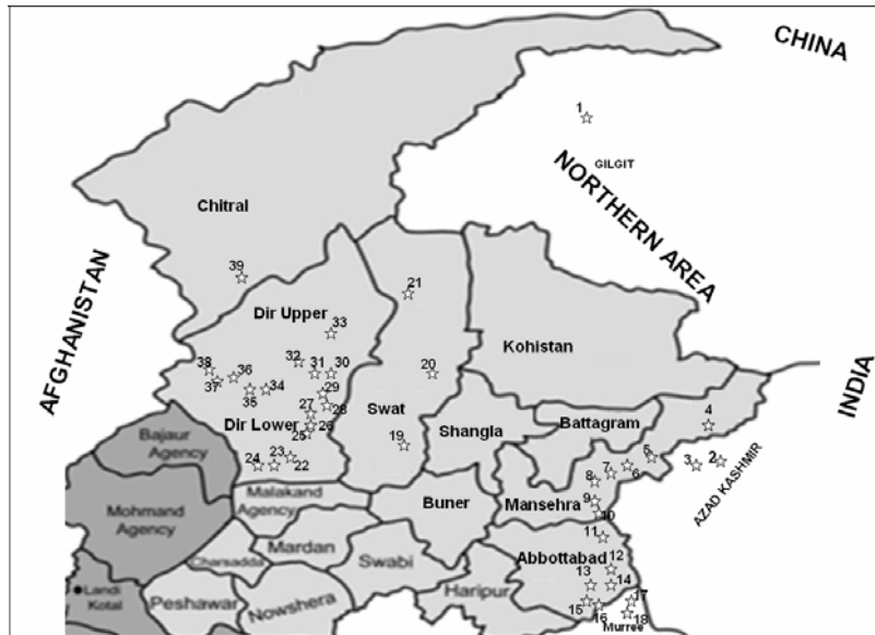
Fig. 1. Map of study area. For locations and sampled species, please refer to the Tables 1 & 2.

Tree age varies from site to site, species to species, within a species and even in similar sized trees of the same species in an area. Ahmed (1988) reported significant relation between diameter and age from planted tree species of Quetta. Ahmed & Ogden (1987) found significant, but wide variance between these two variable. Ahmed & Sarangzai (1991) also obtained significant correlation between diameter and age in nearly all investigated species and sites. However they also observed wide variance and concluded that at least in natural forest diameter is not a good indicator of age. Similarly in present study diameter is not significantly related with age (Fig. 2) except in Pinus roxburghii like Dbh and age, elevation and growth rates also do not show any significant relation.