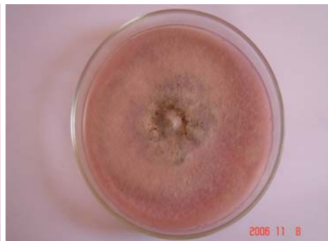
Fig. 1d. Albino colored colony of Bipolaris sorokiniana .