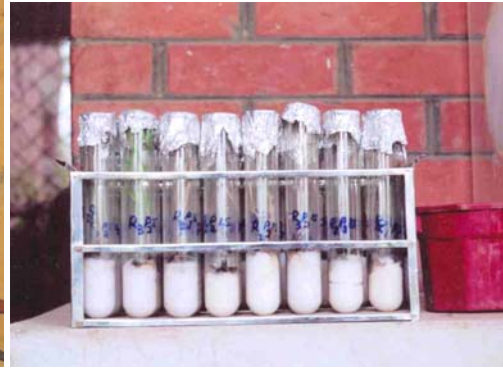
Fig. 3a. Pathogenicity test by test tube moist cotton swab method.