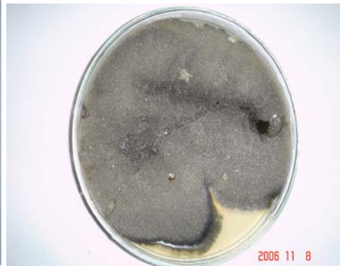
Fig. 1b. Grayish black colored colony of Bipolaris sorokiniana .