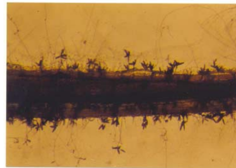
Fig. 3c. Conidia of Bipolaris sorokiniana on surface of wheat leaf.