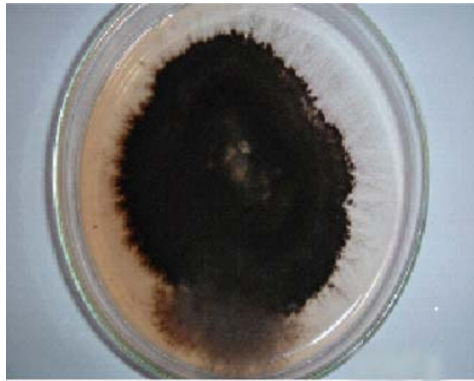
Fig. 1a. Black colored colony of Bipolaris sorokiniana .

Pathogenicity: The pathogenicity of all the isolates collected during 2004 and 2005 from different agro-ecological zones confirms the Koch's postulate by using cv. Wafaq-2001 through cotton swab method technique (Fig. 3a, 3b and 3c), however their reaction to the pathogen varied in terms of aggressiveness.