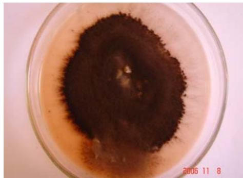
Fig. 1c. Brown colored colony of Bipolaris sorokiniana .