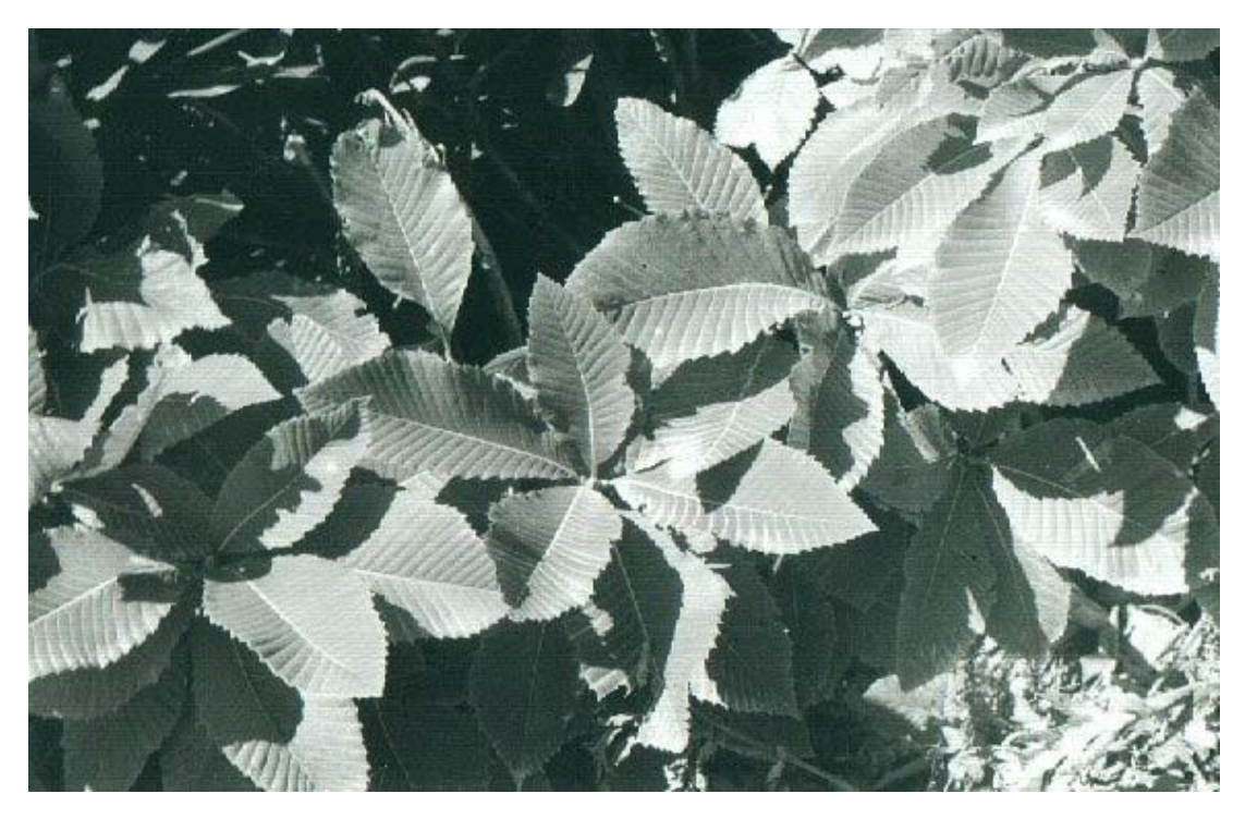
Fig. 1. General feature of Q. pontica .

The allocation of nutrients especially nitrogen within a tree have profound impacts on the physiology, growth and distribution of tree species. Tissue nitrogen concentration and allocation greatly influence the ecophysiology of species. Foliar nitrogen concentration is correlated with photosynthetic rates (Reich et al. , 1995; Martin et al. , 1998). Foliar nutrient content is widely recognized as an effective measure of the nutritional status of plants because leaves are the primary sites of physiological activity including photosynthesis, respiration, transpiration, gas exchange and nutrient storage (Orgeas et al. , 2002).