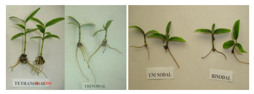
Fig. 1. Tetranodal microcuttings exhibiting more number of leaves as compared to tri nodal, bi nodal and uninodal microcuttings.

acclimatization. It is reported by Salisburry & Ross (1978) that roots help in absorption and movement of nutrients through the transportation stream with the help of water and maintain shoot-root balance, which is the most important factor for plant development ex vitro . The survived tetranodal microcuttings grew more quickly with lush green leaves and healthy stems up to a height of almost one feet (30 cm) within 6 months in glass house (Fig. 3). While uninodal, binodal and tri nodal microcuttings grew slowly and merely reached the stem length of 12 cm, 15 cm and 20 cm correspondingly in the same time interval (Fig. 4-a, b and c).