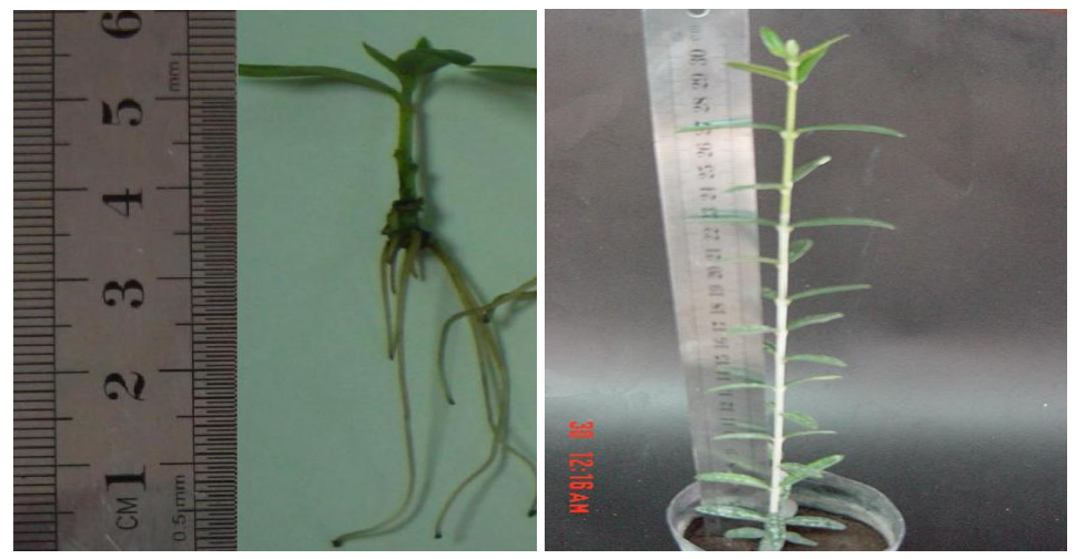
Fig. 2. Development of longest roots in tetranodal microcuttings at 1.25 mg I^{-1} IBA (T<sub>6</sub>).