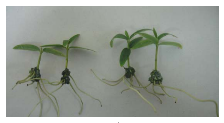
Fig. 5. Vigorous long roots produced at 1.25 mg l^{-1} IBA (T<sub>6</sub>) consequently increasing the survival of microcuttings during acclimatization.