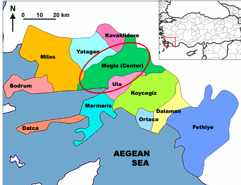
Figure 1: Mugla Province, its administrative districts and location in Turkey.

The use of biological materials for monitoring heavy metal air pollution was introduced 30 years ago. Since then, numerous biomonitors have been used to monitor heavy metal pollutions (Augusto et al. , 2007). These include mollusks, fishes, birds, cyanobacteria, lichens, mosses, and many parts of plants (tree barks, tree rings, pine needles, grasses and leaves) (Lovett et al. , 1997; Aksoy & Öztürk, 1997; Sakurai et al. , 2000; Augusto et al. , 2007; Aksoy, 2008; Atiq-Ur-Rehman and Iqbal, 2008). Some plant species of these groups have more ability of accumulating high levels of metals and other toxic elements, without showing any visible injury, such as leaf necroses and discolorations. These are then denominated accumulator or biomonitor plants (De Temmerman et al. , 2004).