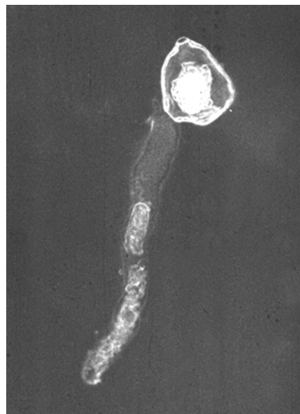
Fig. 2. Malus pumilla : Germinating pollen (LM). Storage after 20 weeks at -20C (x 40).