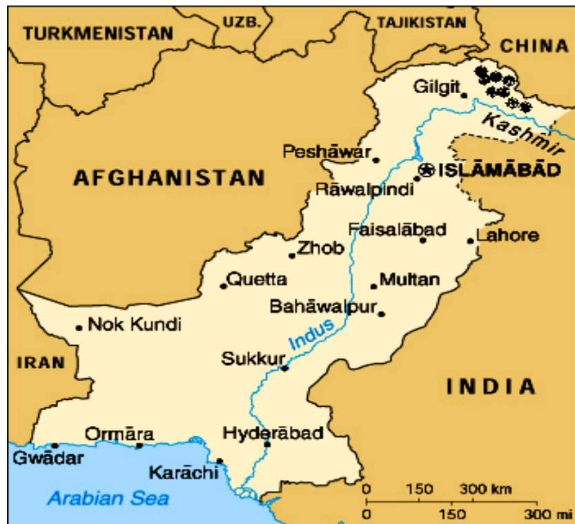
Fig. 1. Location of the study sites in Chapursan Valley, Pakistan. The Cluster of black circles at the far end of the map indicates the study area

Vegetation analysis: Presence/absence data were used to classify and ordinate both sites and species by reciprocal averaging (RA) procedure of Hill & Gouch (1980). Since the presence of rare species can severely distort ordinations produced by RA (Hacker, 1983), such species were eliminated from the analysis. These were species occurring in only a single stand. Detrended Correspondence Analysis (DCA) was selected as an appropriate ordination method based on gradient length and preliminary correspondence analysis (Jongman et al. , 1995). The default options of the program DECORANA (Hill, 1979; Causton, 1988) were used for the analysis. DCA axes 1 and 2 were used to data interpretation.