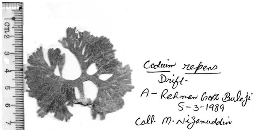
Fig. 1. Habit of Codium repens Vickers.