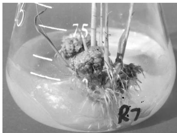
Fig. 2. Embryoid induction and its subsequent regeneration into plantlets on MS containing 1.5 mg/l Kn and 0.5 mg/l NAA.

When the concentration of Kn was further enhanced to a level of 2.0 mg/l, while keeping NAA concentration at 0.5 mg/l, excellent embryoid induction was observed within two weeks. The number of embryoids were about 20 per callus culture in the third week. These embryoids started germination and developed into complete plantlets after four weeks (Table 1).