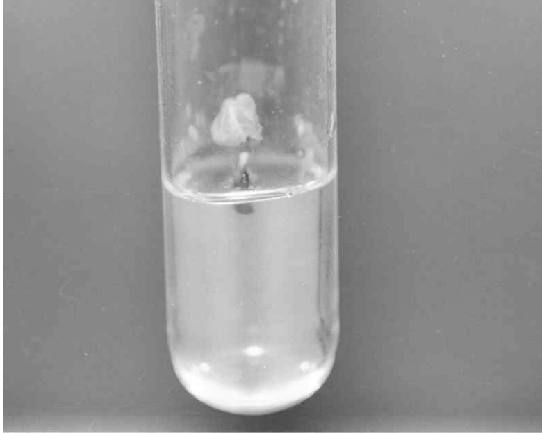
Fig. 1. Seed germination in cotton Var. CIM-443 7-days old seedling