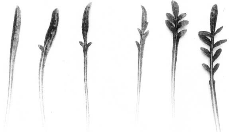
Fig. 3. Diagrammatic representation of variation in leaf shapes in Gazania splendens.