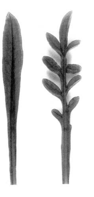
Fig. 1. Juvenile and adult leaf shapes of Gazania splendens.

Determination of anthocyanin content: Relative anthocyanin levels of Gazania splendens leaves were determined by incubating them overnight in 150 \mu L of methanol acidified with 1% HCl (v/v). After the addition of 100 \mu L of distilled water, anthocyanins were separated from chlorophylls with 250 \mu L of chloroform. Total anthocyanins were determined by measuring the A<sub>530</sub> and A<sub>657</sub> of the aqueous phase using a spectrophotometer. By subtracting the A<sub>657</sub> from the A<sub>530</sub>, the relative amount of anthocyanin was calculated as OD/g.fw. (Neff & Chory, 1998).