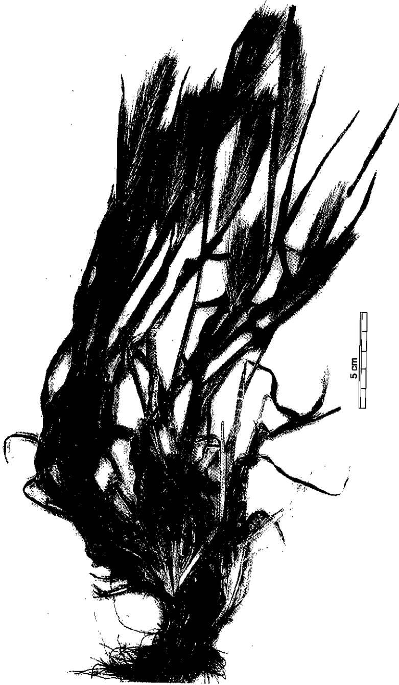
Fig. 1. Hordeum leporinum Link, Habit. (W: Lorestan; Khorramabad, Pol-e Dokhtar, 47° 43' E, 33° 07' N, elev. c. 1650 m).