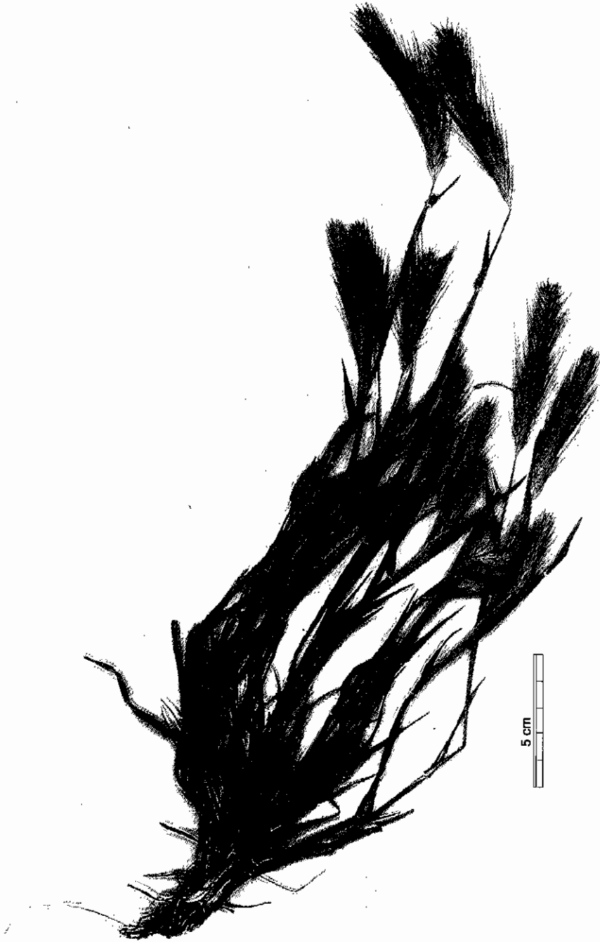
Fig 2. Hordeum glaucum Steud., Habit. (S: Kerman; 15 Km W Baft towards Syrjan, 56° 28' E, 29° 18' N, elev. c. 1980 m).