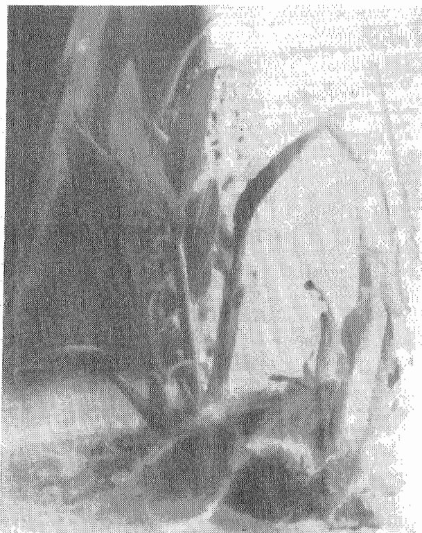
Fig. 3. Shoot bud induction and its growth into plants on callus from Fig. 2.

from various tissues were morphologically different. Soft and friable calli developed from shoot primordia, whereas hard and compact calli developed from 2 week old buds on treatment with the same concentrations of hormones. Very young buds could only induce a slight callus and gave rise to multiple plantlets. Callus formation from tissues placed on nutrient agar occurs at widely different rates which suggests that the origin of the explant can be critical.