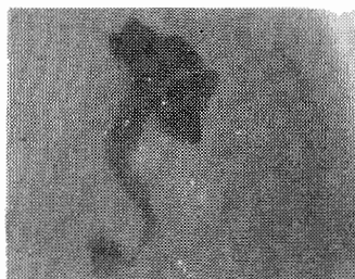
Fig. 4. Embryo after transfer to solid medium containing GA_3 .