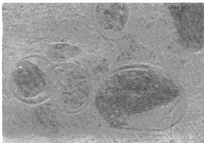
Fig. 1. Different developmental stages of embryo formation in suspension cultures of Papaver somniferum .

- = no callus, + = Some callus, ++ = Moderate callus, +++ = Good callus, ++++ = Excellent callus.